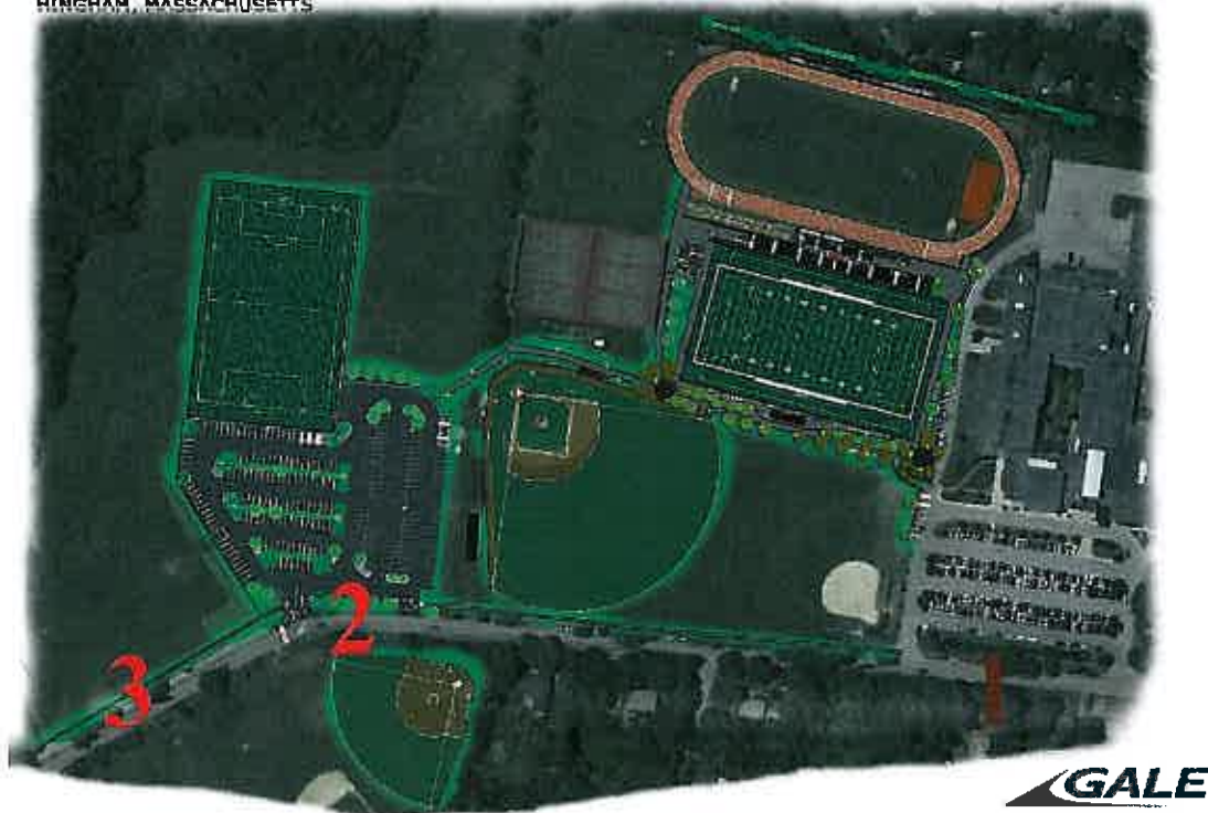
HINGHAM HIGH SCHOOL ATHLETIC FIELD REDEVELOPMENT PROJECT HINGHAM, MASSACHUSETTS