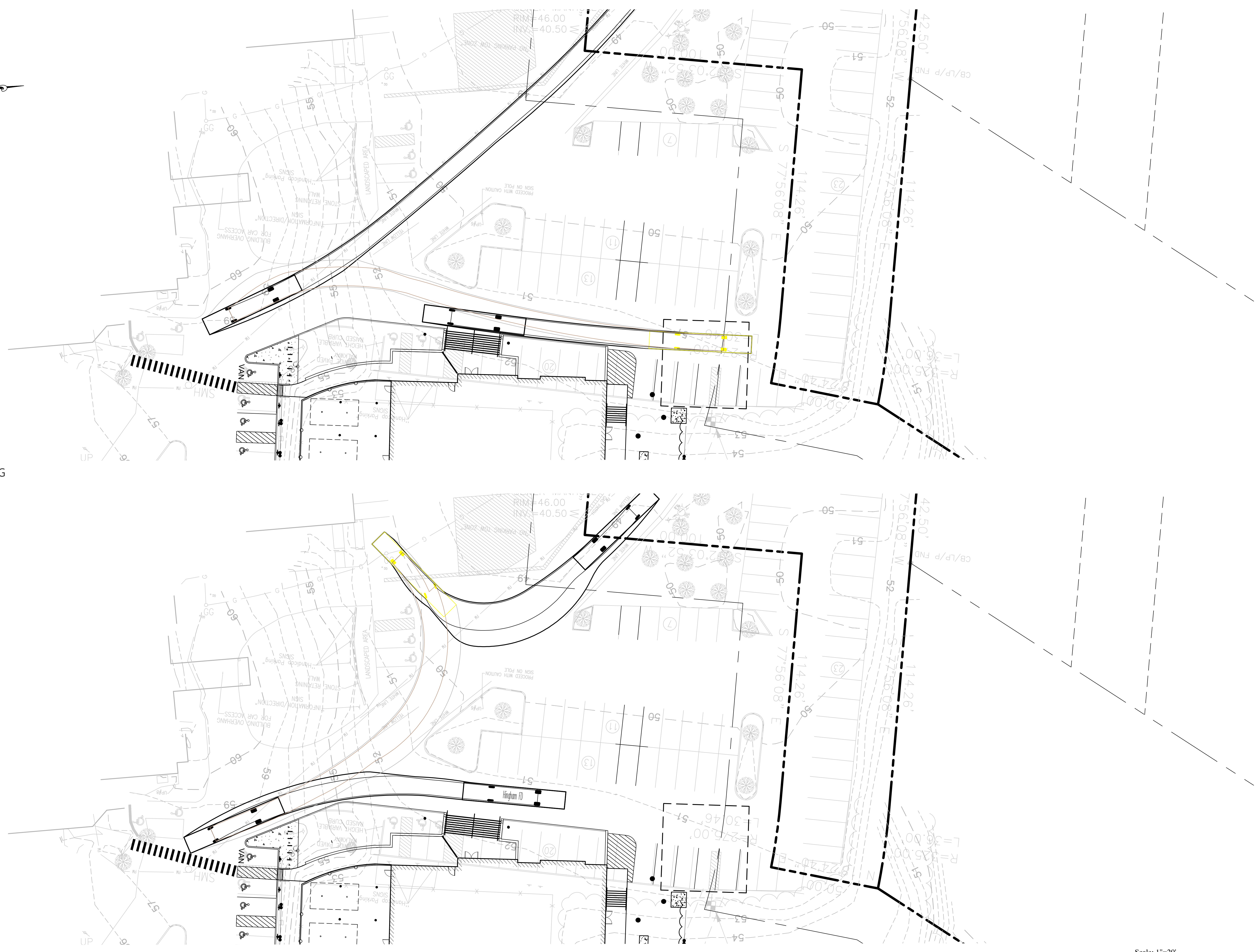
FIRE TRUCK - DEPARTING